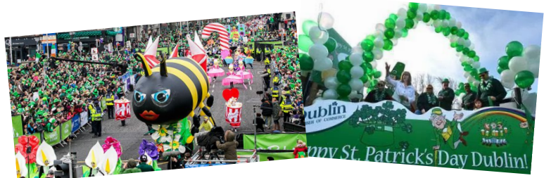
St. Patrick's Parade

St. Patrick's Parade - Ireland celebrates its patron saint St. Patrick on the 17th of March each year.