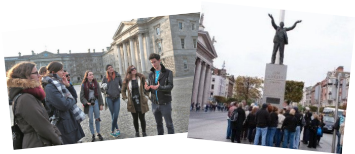
1916 Rebellion Walking Tour

1916 Rebellion Walking Tour is definitely one of the best tours of the city. A fascinating tour of central Dublin focused on the events surrounding the 1916 Rebellion.