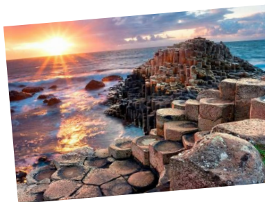
The Giant's Causeway